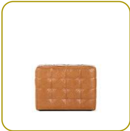
CU02 Qu stool, deep quilted

In accordance with EN 15804+A2 and ISO 14040 / ISO 14044