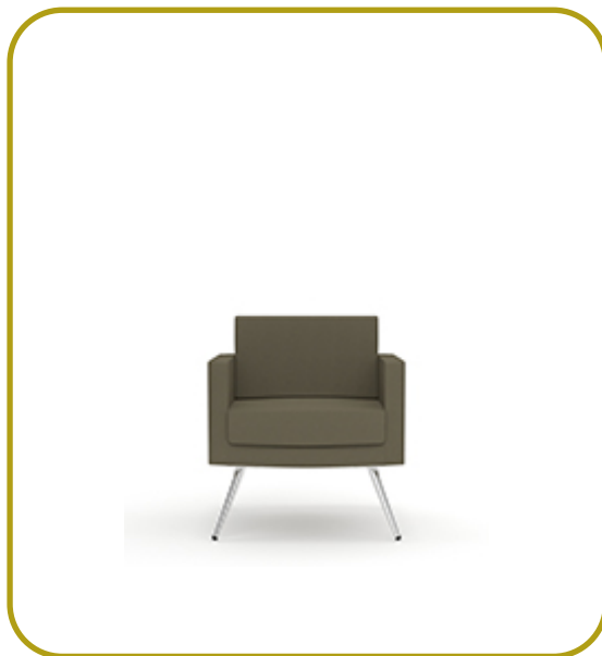
FIFT01 Fifty Series Armchair

In accordance with EN 15804+A2 and ISO 14040 / ISO 14044